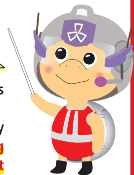
Shinagawa disaster prevention mascot Jijo-kun

How will you handle your toilet needs in the event of a disaster? Learn about it now so you'll be ready if a disaster occurs!