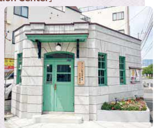
Reference: Shinagawa History Tours (in Japanese only)

10:00 a.m. to 5:00 p.m. on Mondays, Thursdays and Saturdays