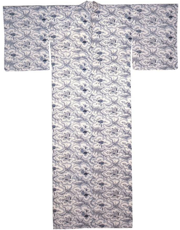
▲ A yukata with a Shinagawa motif (reproduction)

Autumn was a time to enjoy the vividly colored leaves of trees in Kai'an-ji Temple, said to be the best in Edo, and winter was the season when seaweed was harvested to make Shinagawa's famous nori laver. These various scenes were well-loved subjects for ukiyo-e illustrations, and were featured in the works of many masters, such as Utagawa Hiroshige and Katsushika Hokusai.